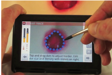
Trace it with the stylus.