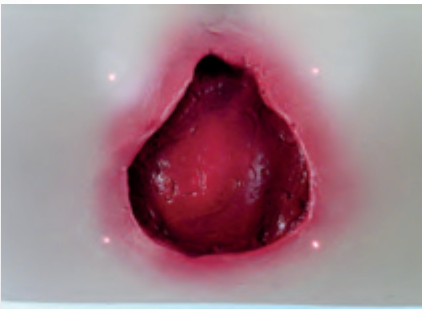
Photograph the wound.